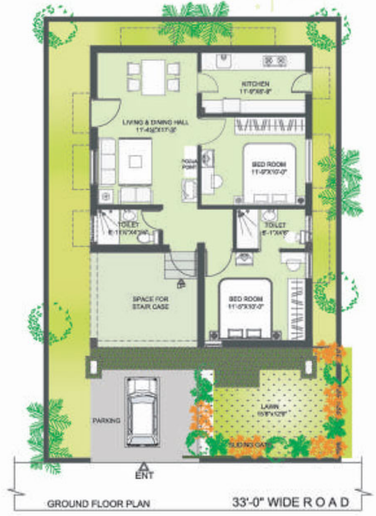
PLAN - EAST FACING